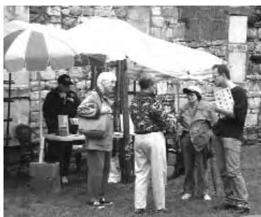
Welcoming many first-time visitors even in the rain at last Fall’s OHNY.

NYMC is one of 200 usually inaccessible sites showcasing the best of the city’s architecture.