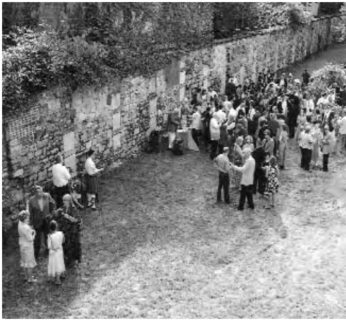
The wall as backdrop for wedding guests.