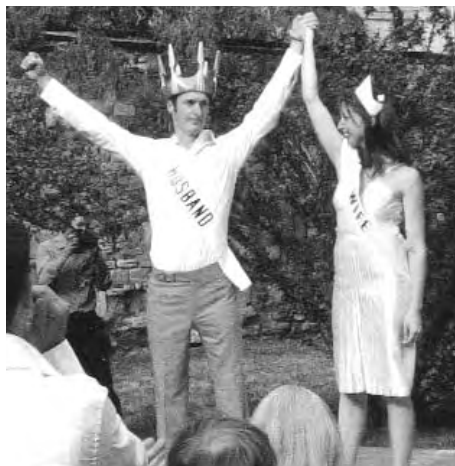
“A great place to get married.”

In 2004, while taking a Sunday stroll with both of their fathers, who were in town to meet for the first time and celebrate the couple’s engagement, they walked past the Cemetery and found the gates wide open for Open House New York. They entered and found a sunny, quiet half-acre green space insulated from the hustle and bustle of the Lower East Side.