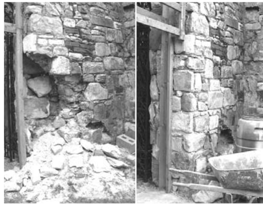
Left: Southeast corner before. Right: Stonework done.