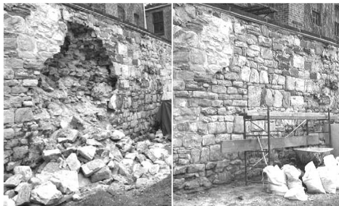
Left: East wall before. Right: Stonework nearly completed.

By the same token, the Cemetery supports and commends the work of the LPC (supported by the Historic Districts Council and other City preservation groups) and the sponsorship of Councilmember Tony Avella, in the passage of The Failure To Maintain/Demolition by Neglect Bill (Intro 403B), which was adopted by the City Council, 47- 0, on February 15, 2005.