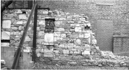
Leaning North wall braced with steel beams.